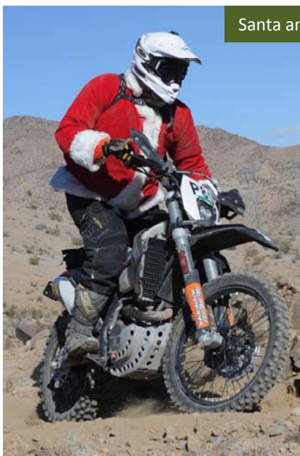
Santa and his Elf!