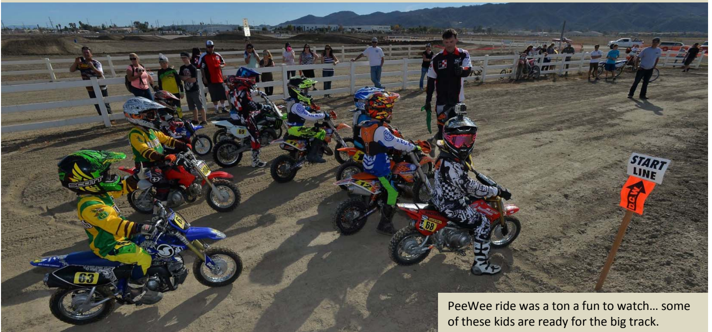
PeeWee ride was a ton a fun to watch... some of these kids are ready for the big track.