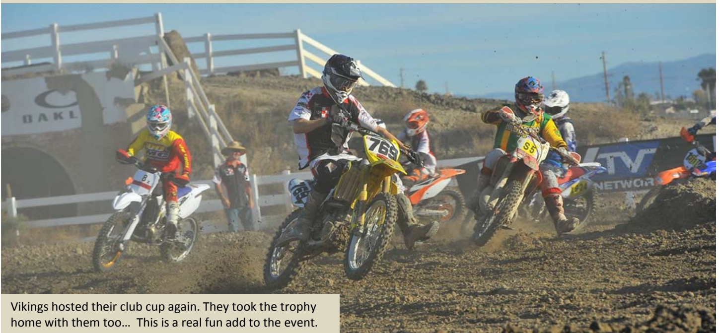
Vikings hosted their club cup again. They took the trophy home with them too... This is a real fun add to the event.