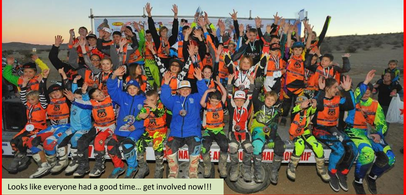
Looks like everyone had a good time... get involved now!!!