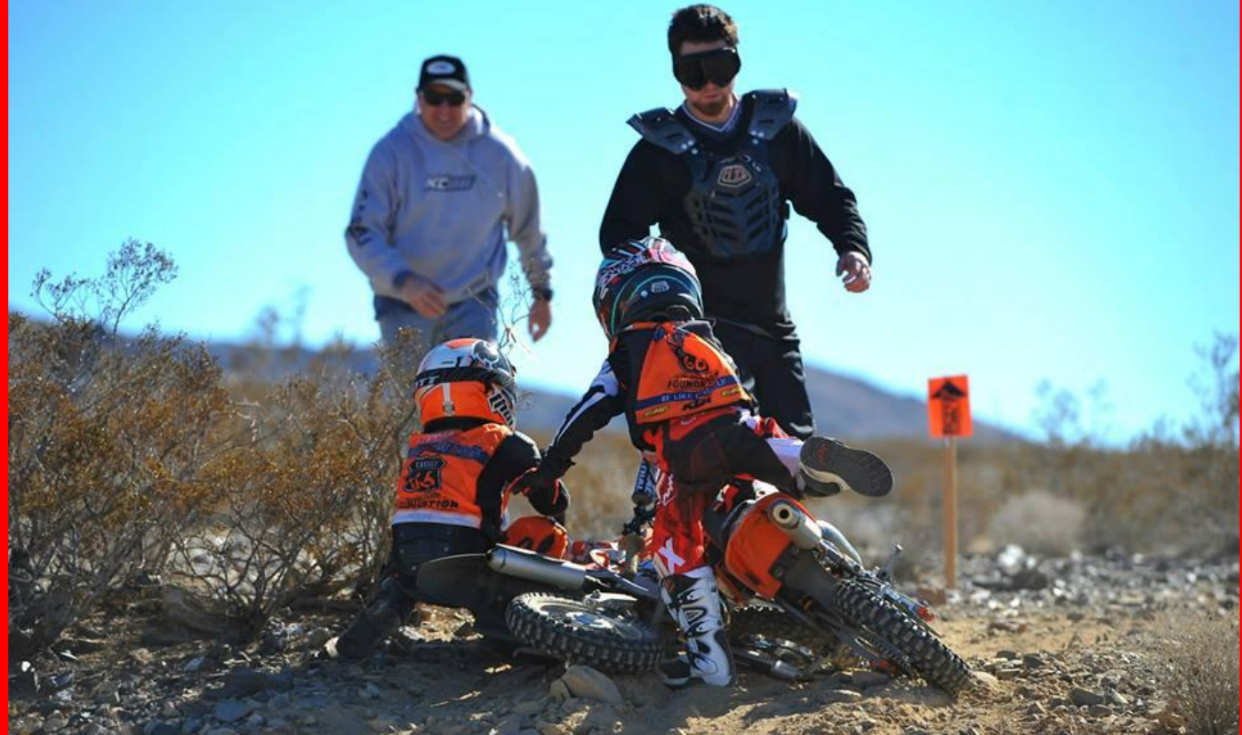
I love this photo, couple of little dudes get together, and we have the manpower to get 'em going again. Great work here!