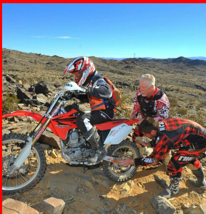
Plenty of help along the course to get through anything. Challenging, but fun. Great Job Volunteers!!